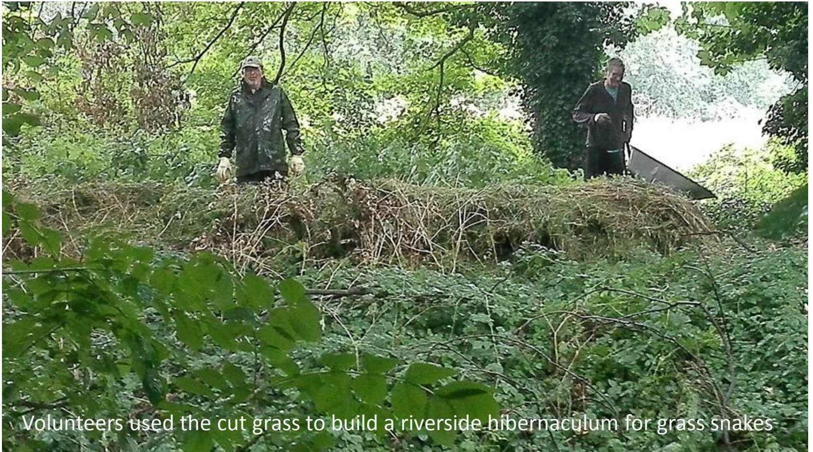
Volunteers used the cut grass to build a riverside hibernaculum for grass snakes