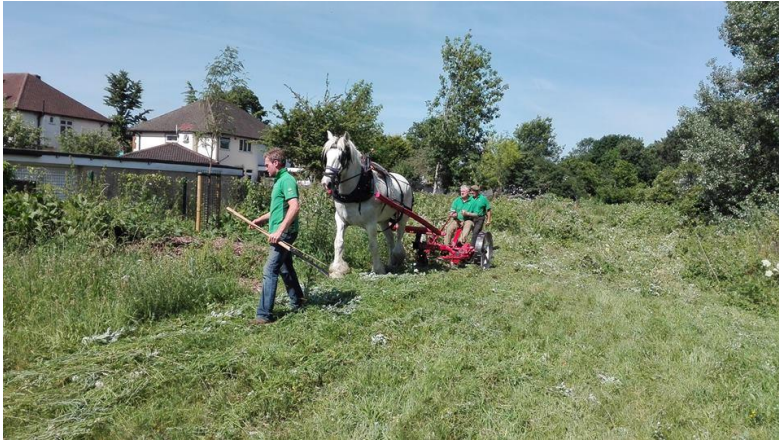
Students from Waldegrave School at Willow Way clearing the hay cut.